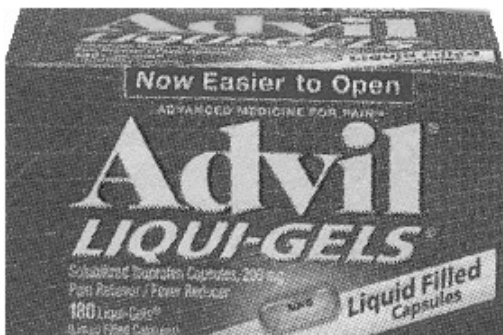
cold and allergy medication